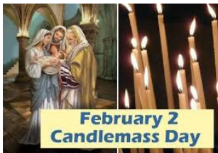
February 2 Candlemass Day

To sign up, go to formed.org/signup , type in St. Mary Marion (subscription is for both parishes), or the zip code 43302, and create your account.